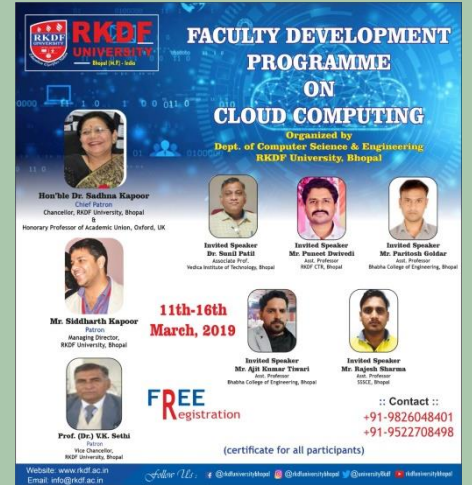
FDP on Cloud Computing