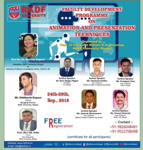
FDP Program on Animation and Presentation Techniques