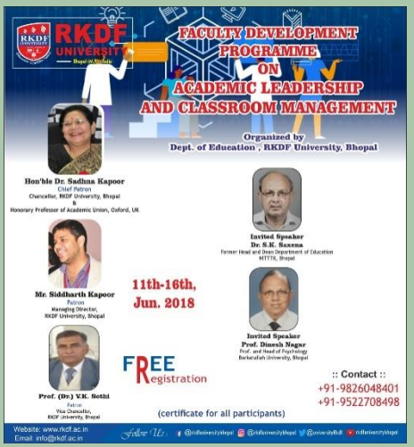
FDP Program on Academic Leadership and Classroom Management