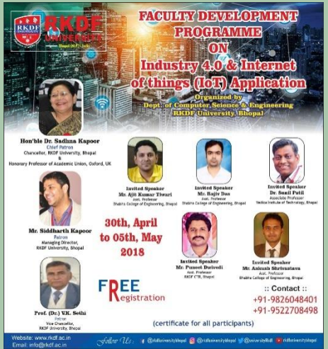
FDP Program on Industry 4.0 & Internet of Things (IoT) Application