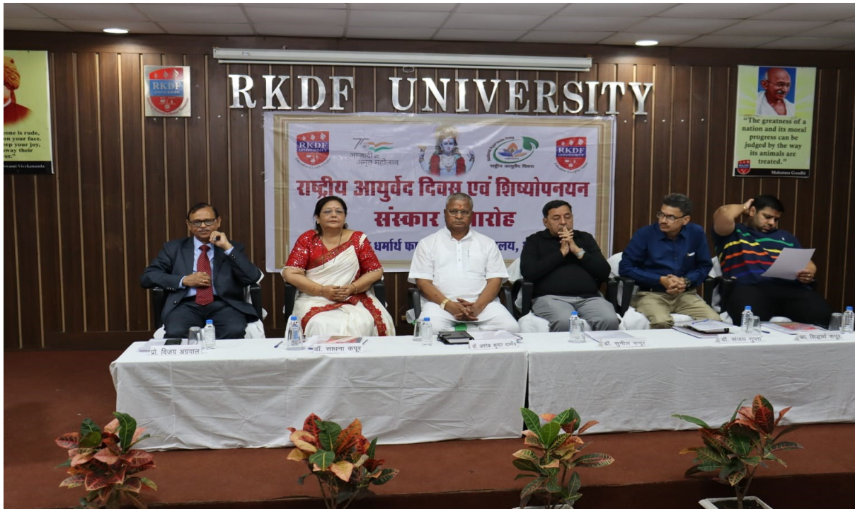
Chief guest with other dignitaries on the dias