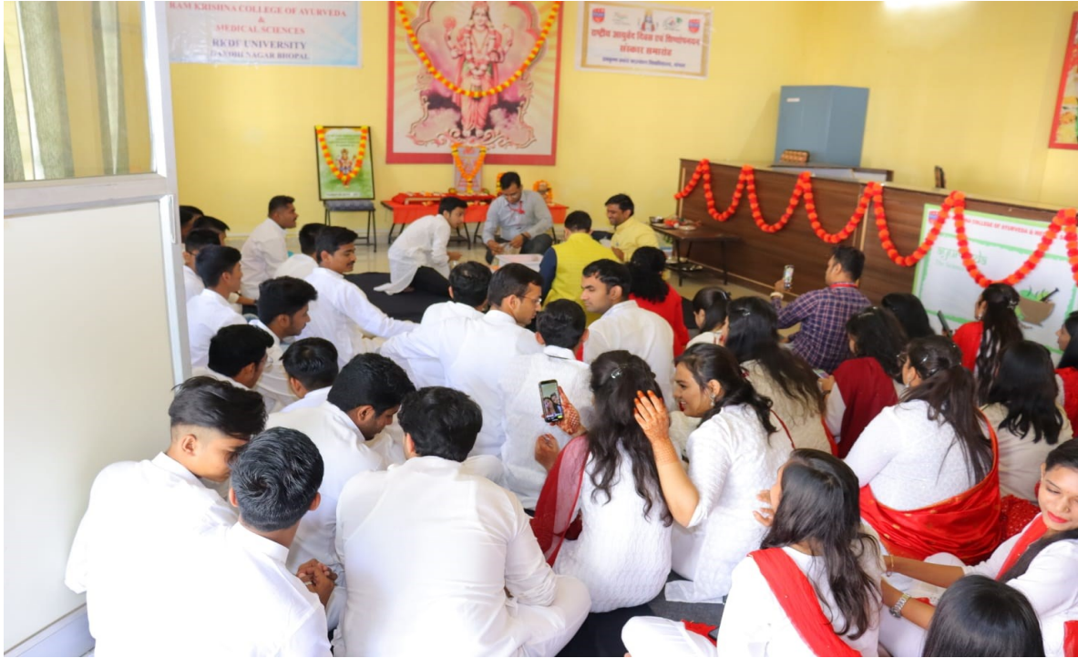
Holy Dhanwantari hawan in presence of staff and students