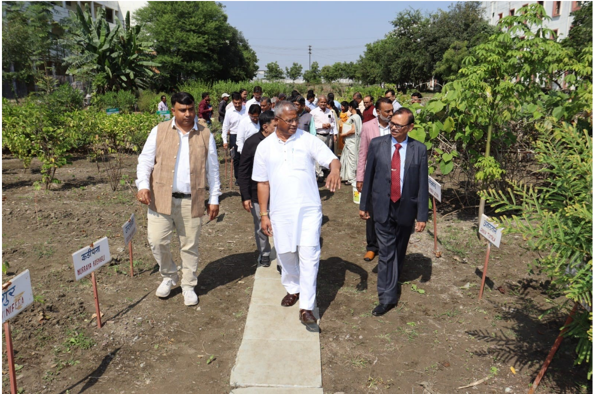
Visit to the Herbal Garden of the institute