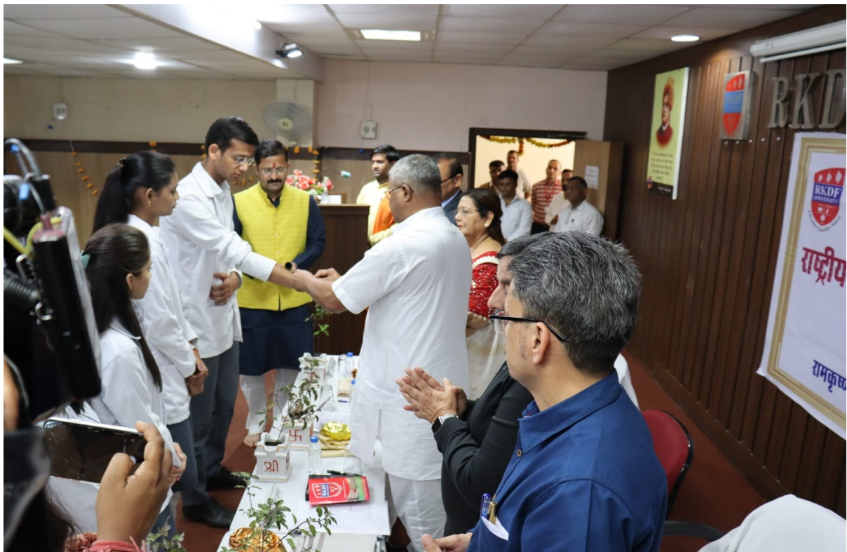
Welcome of students by traditional way of Gurukul Parampara