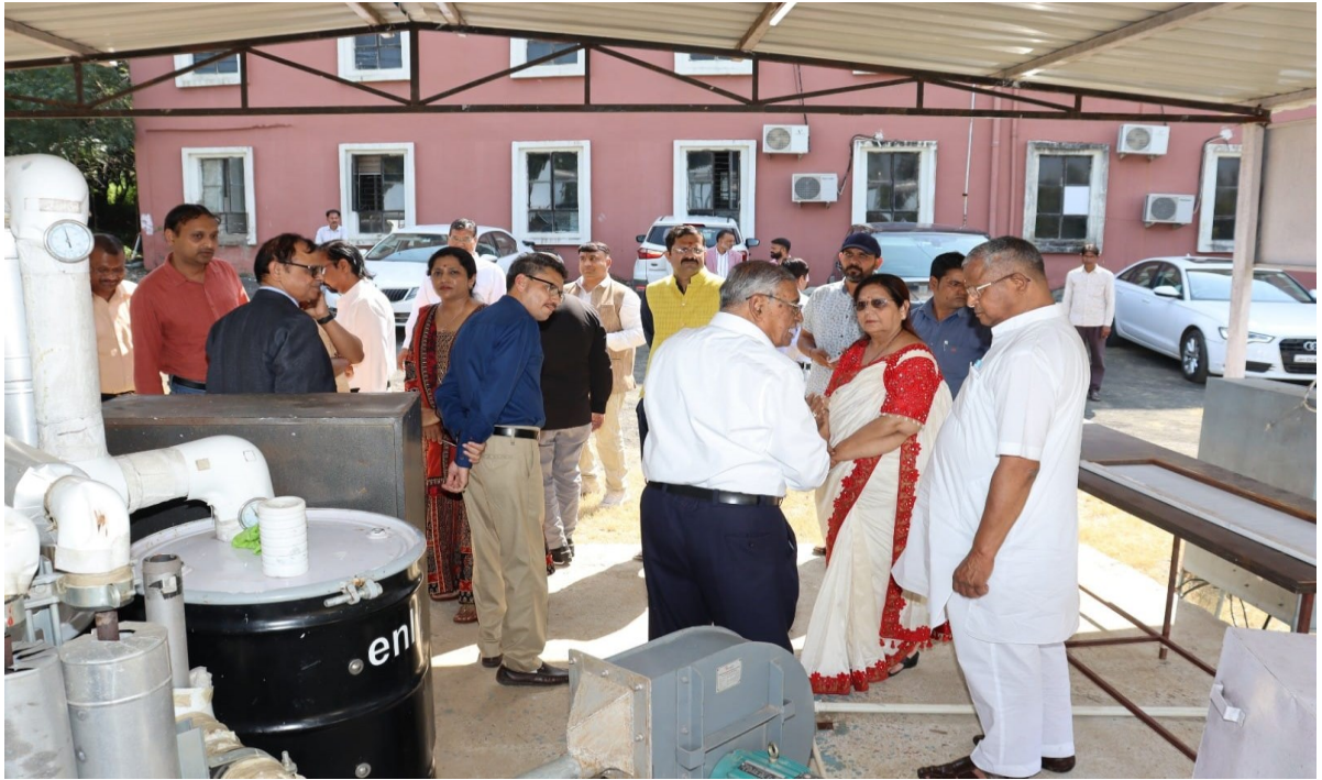
Visit of guests to different research projects of University